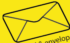
Mail & envelopes