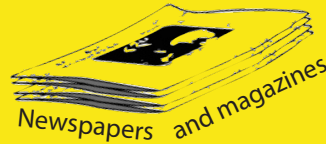
Newspapers and magazines

Staples and plastic envelope windows may be included