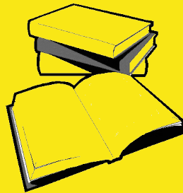
Books (hard and soft cover)